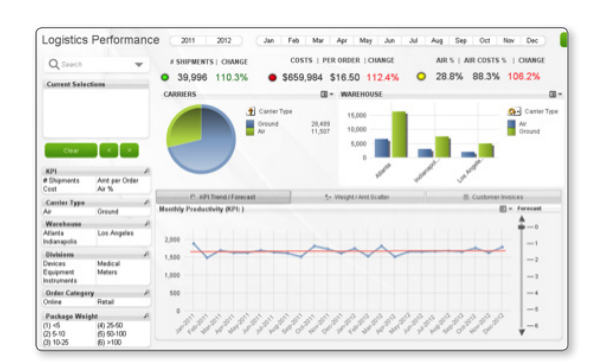
Example: A single dashboard view of transportation and logistics performance across the end-to-end supply chain.