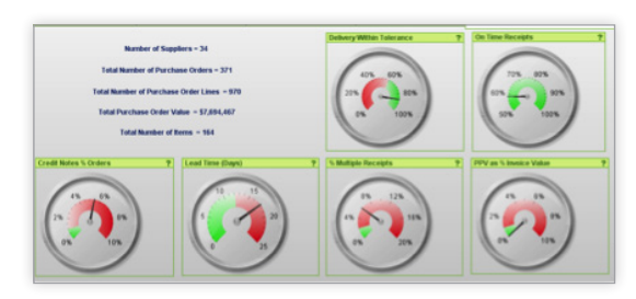
Example: A Supplier Scorecard showcasing vendor performance across key supply chain KPI's